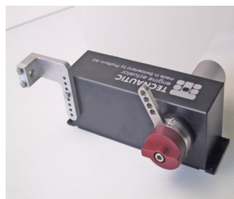
Throttle or shift actuator for mechanically operated engines. Torque 200 ins.lbs. (22 Nm), pulling force 90 lbs. @ 3 in. travel (400 N @ 80 mm), weight 4 lbs/1.7kg