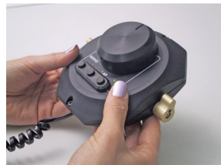
Remote control on a 20 ft. (6 m) spiral cord

The Fly-By-Wire Steering Wheel makes steering easier than driving a car. Turns are gyro stabilized. Avoiding actions become easy. Putting the wheel in its center detent will draw a straight line on your plotter. By deflecting the wheel, the desired turn rate is selected. Toggle switches are used for individual Thruster control and for Speed selection.