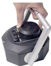
Fly-By-Wire Throttle Station