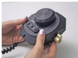
Remote Fly-By-Wire Station